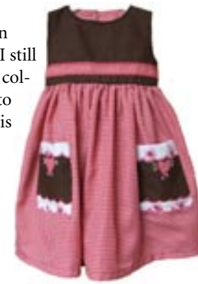
Designed alongside MMU students