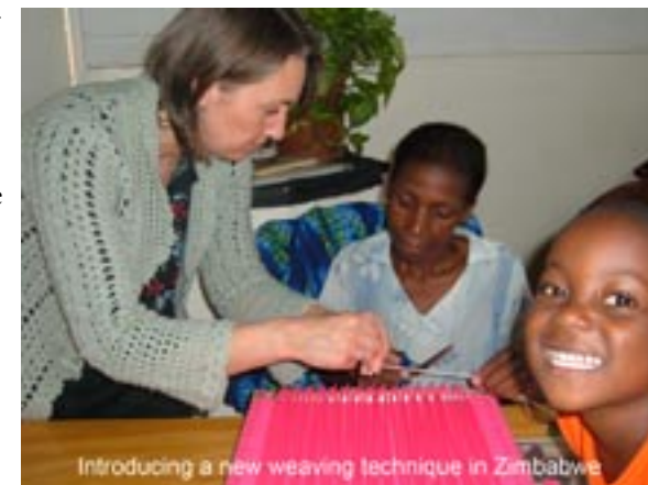
Introducing a new weaving technique in Zimbabwe